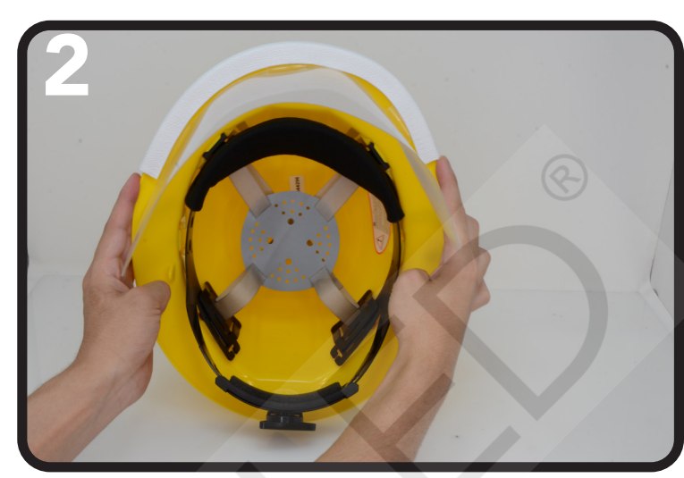
Continue pushing the shield molding into place on both sides, following the shape of the brim and ensuring that the molding remains centered.