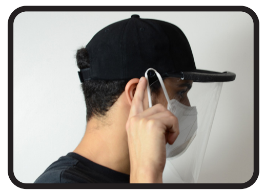
Ensure both mask loops are securely attached to Comfort Shield Mask Button on both sides of Mask Gripping Gap, you are then ready for use.

Glowback LED® 16409 NW 8th Ave Miami Gardens, FL 33169 1-800-679-4902 • info@bluegateinc.com