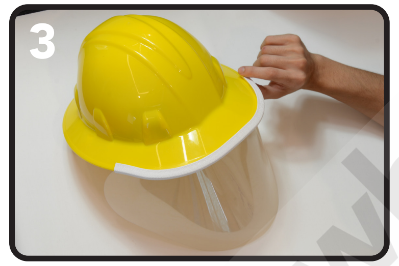
After removing the protective film, your hard hat with comfort shield is ready for use.