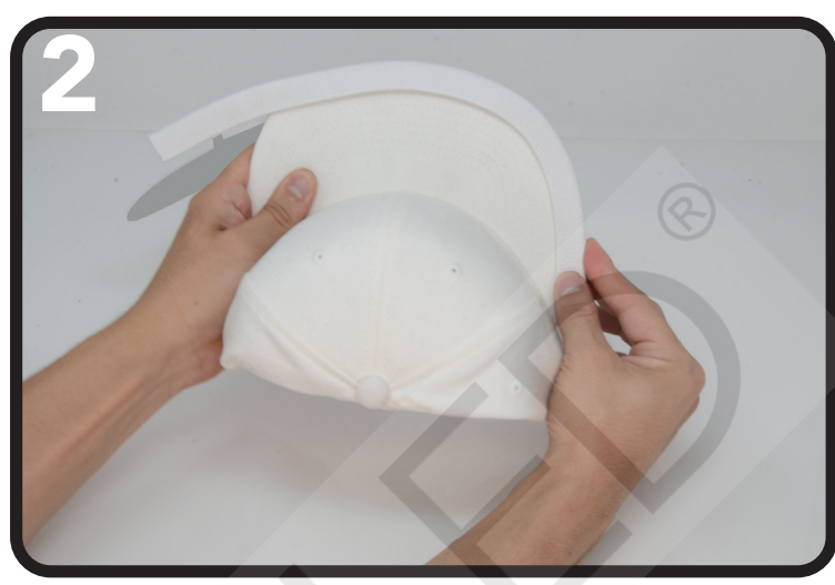
Continue pushing the shield molding into place, following the shape of the brim and ensuring that the molding remains centered.