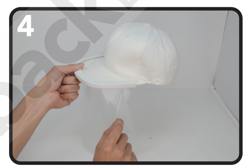
Carefully peel the protective layer off both sides of shield. You are then ready for use.