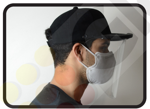
First put your mask on. Then, put your Comfort Shield with Mask Gripping Cap on.