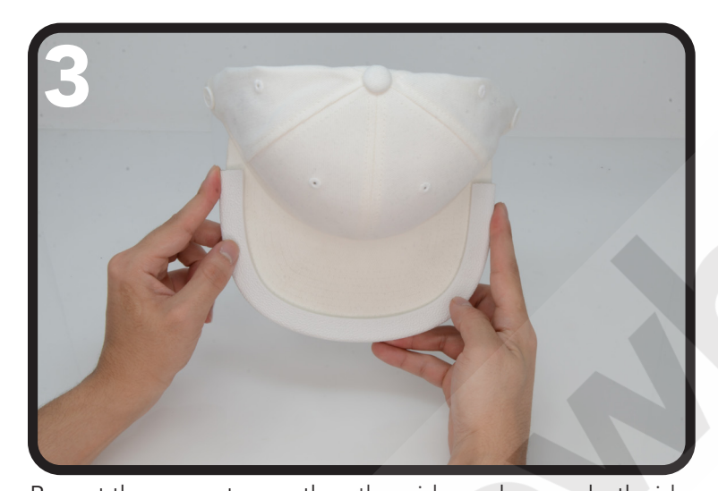
Repeat the same step on the other side, and ensure both sides have a snug fit with no space between the hat and comfort Shield.