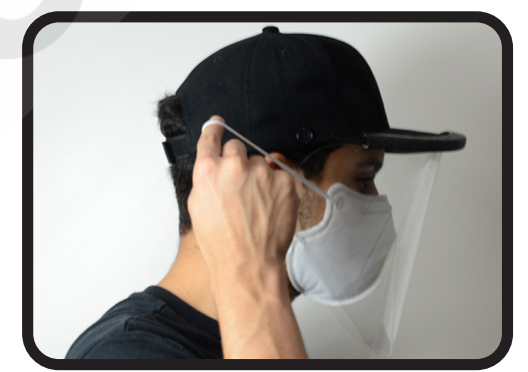
While wearing Comfort Shield with Mask Gripping Cap and face mask, pull face mask ear loops back, and attach them to the Comfort Shield Mask Buttons.